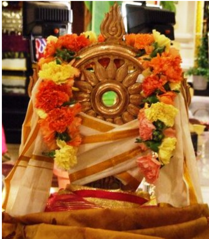
BhagavAn's Chakra Aayudham

6. PadhAdhvA (KesavAdhi upavyUha Moorthys).