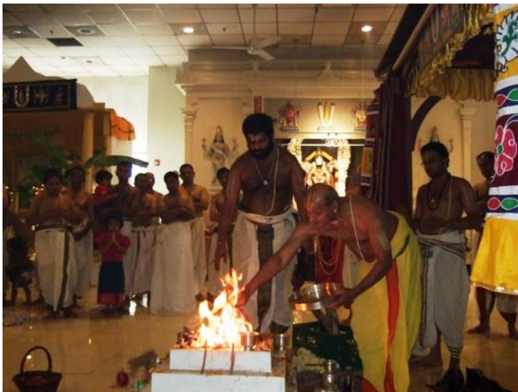
Agni carries the Havis to different Gods Narasimha homam at Sri Ranganatha temple, New York

HAVIS is the term used for the oblations offered to the God, which are tossed with reverence into the Fire. Havis generally is an oblation of burnt offering. It can be clarified butter also. Agni is the medium, which carries the Havis to the different Gods. Havyapaaka - is the oblation cooked with butter and milk.