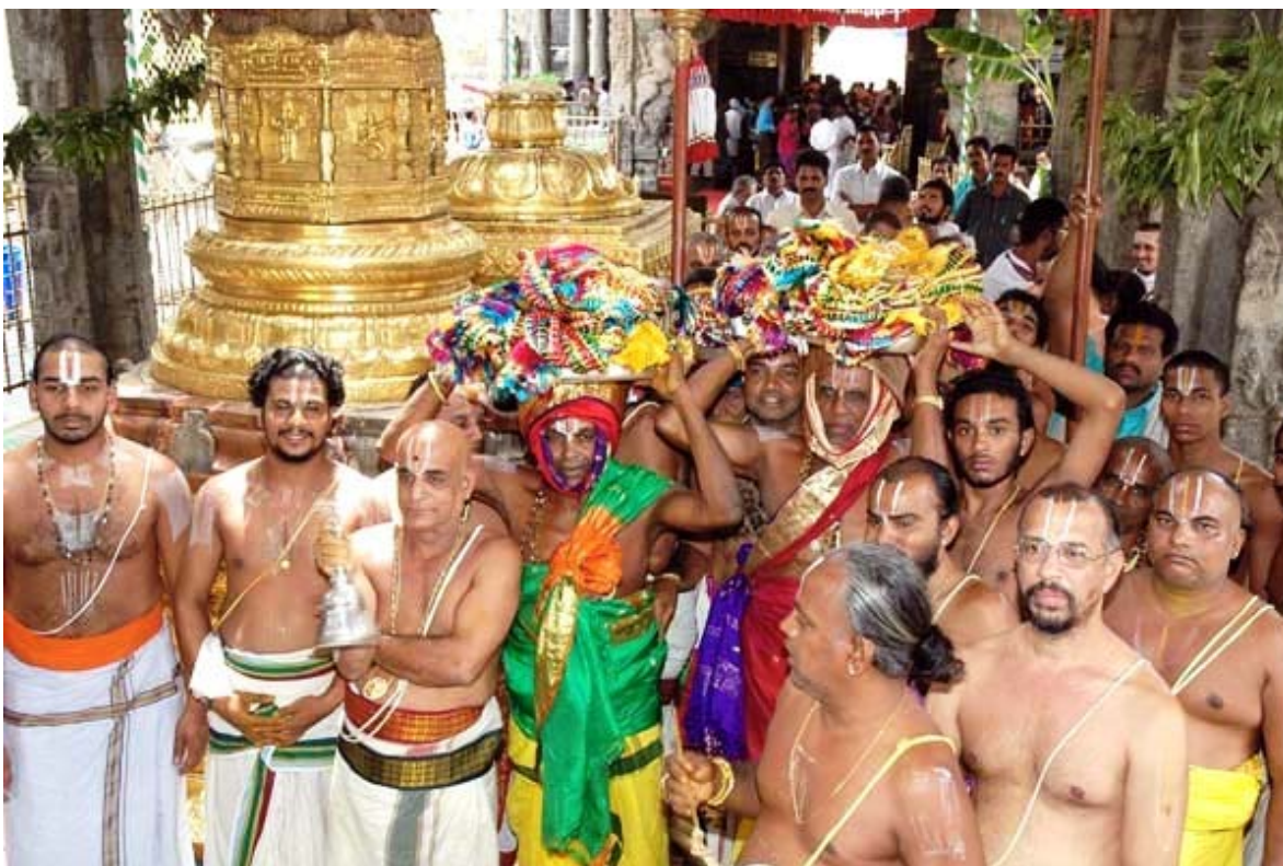
Pavitrotsavam at Thirumalai