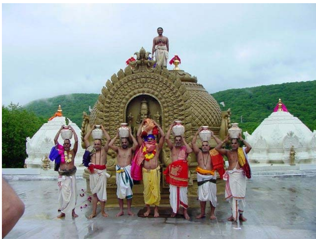
Mahasamprokshanam for Sri Ranganatha Temple at New York

In our MahA samprOkshaNam for Lord RanganAthan, we have to sacrifice all (ego, possessions known as MadhIyam) and regain all (apunarAvrutthi with the anugraham of our AchAryAs) from the most merciful Lord, the Parama DayALu.