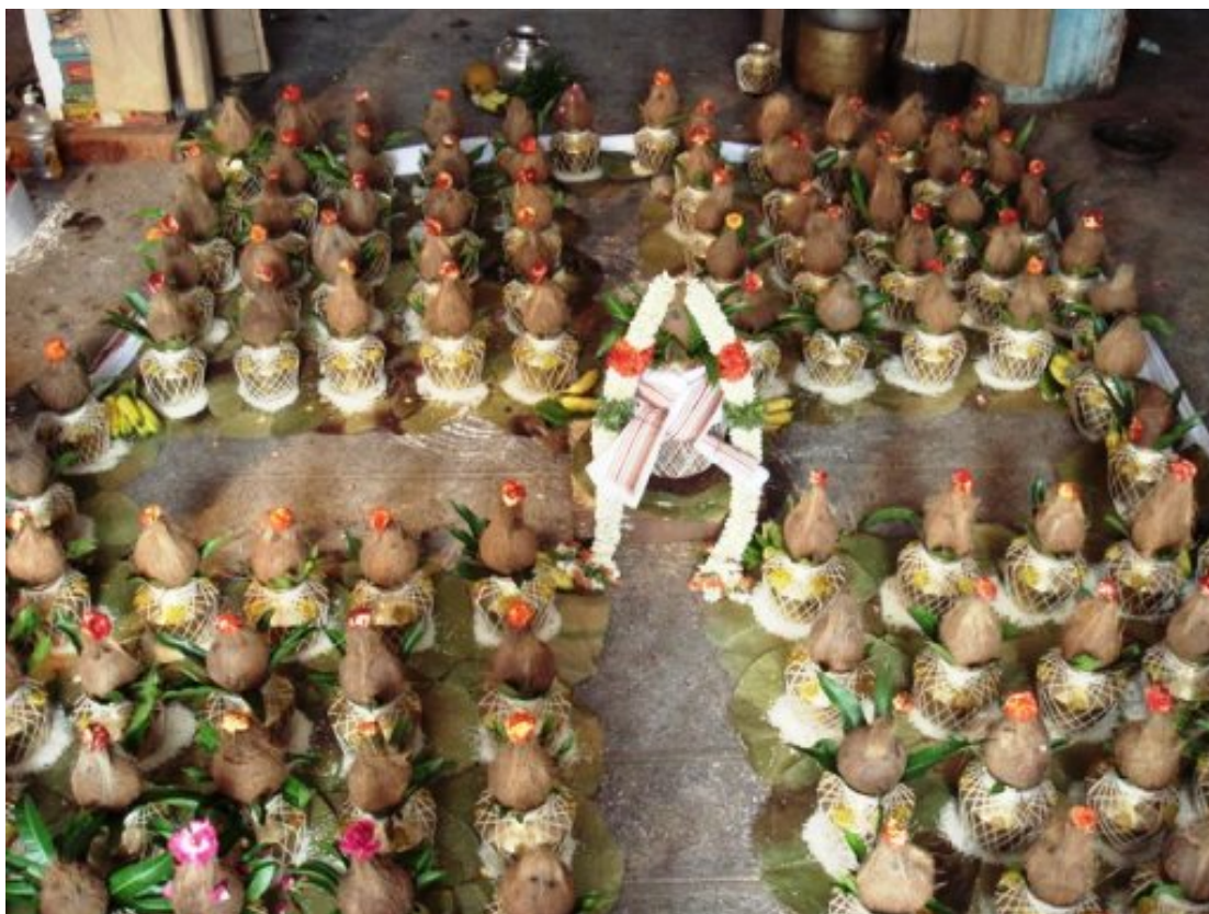
ashtothra satha kalasa thirumanjanam

On the second day, the Lord's eyes are ceremonially open (NethrOnmeeLanam) and right after that Agni KunDa Homam is done to set in motion the other Homams on the subsequent days.