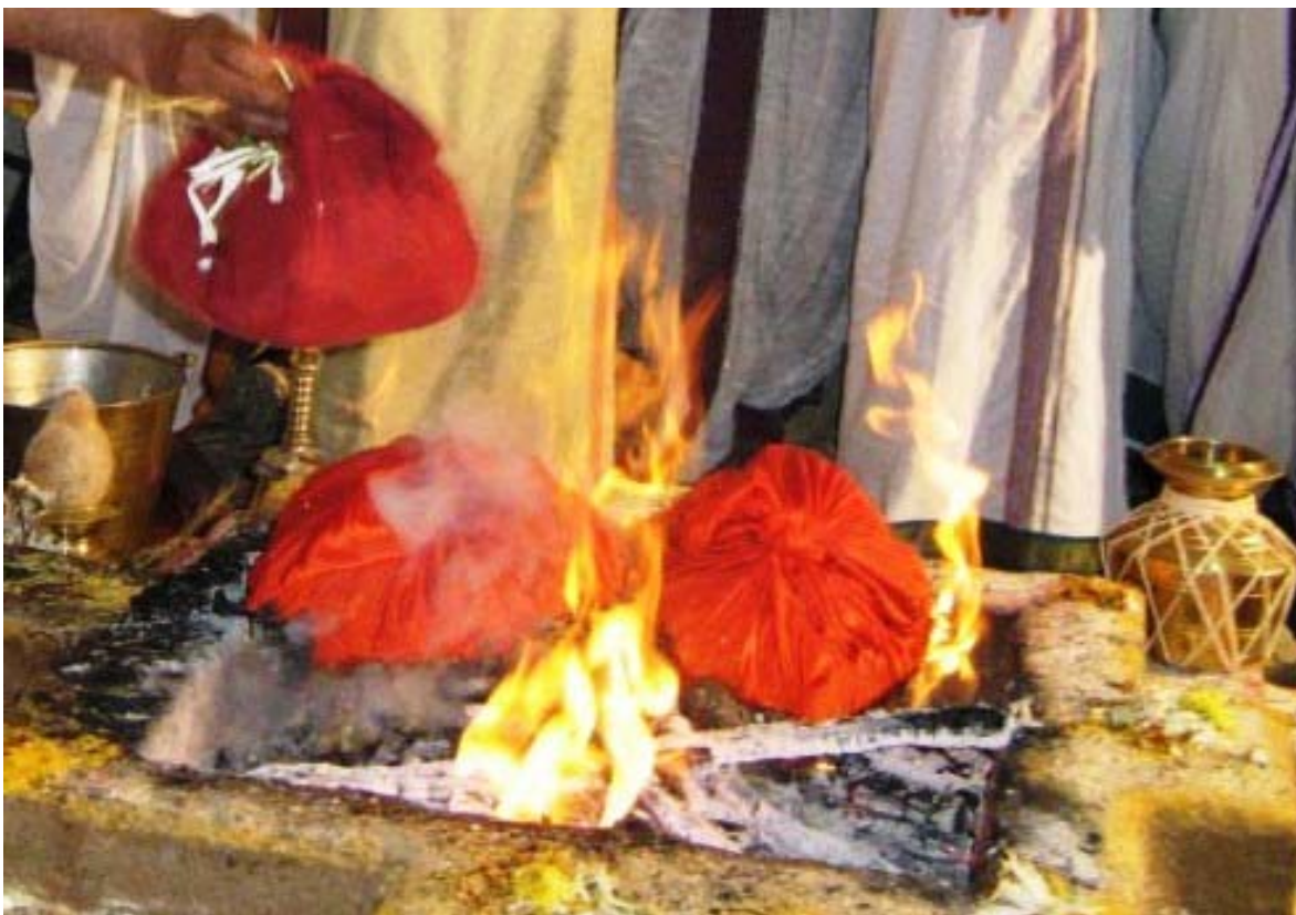
PURNAhUti - various rituals involve agni