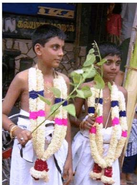
upanayana ceremony - kumbham and palasa dandam

Upanayana means bringing one close to the guru or the teacher, who initiates the child into Veda vidyA. The boy learns one Veda with its limbs (angAs). It takes 12 years to complete the learning of one Veda with its angAs. The boy stays in the house of the guru and observes the ancient practise of gurukulA and performs services to the guru and his family in return for receiving his education. He also practices celibacy (Brahmacharyam) during these 12 years. Brahmacharya is the first of the four aasramAs for a Hindu. The recitation of the VedAs with swarAs (proper intonations) from a qualified guru is the goal of this aasramA.