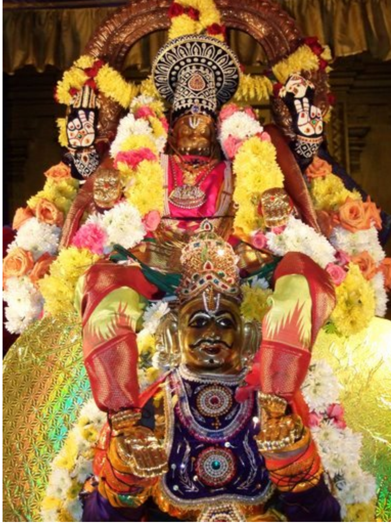
shadgunya sampoorNa bhagavan SrI nrusimhaswamy in garuda vahanam

He provides the fruit of the Homams. What is that Fruit? Attainment of True Knowledge about Him as ShAdguNya SampoorNa BhagavAN is that supreme fruit of the HOmam.