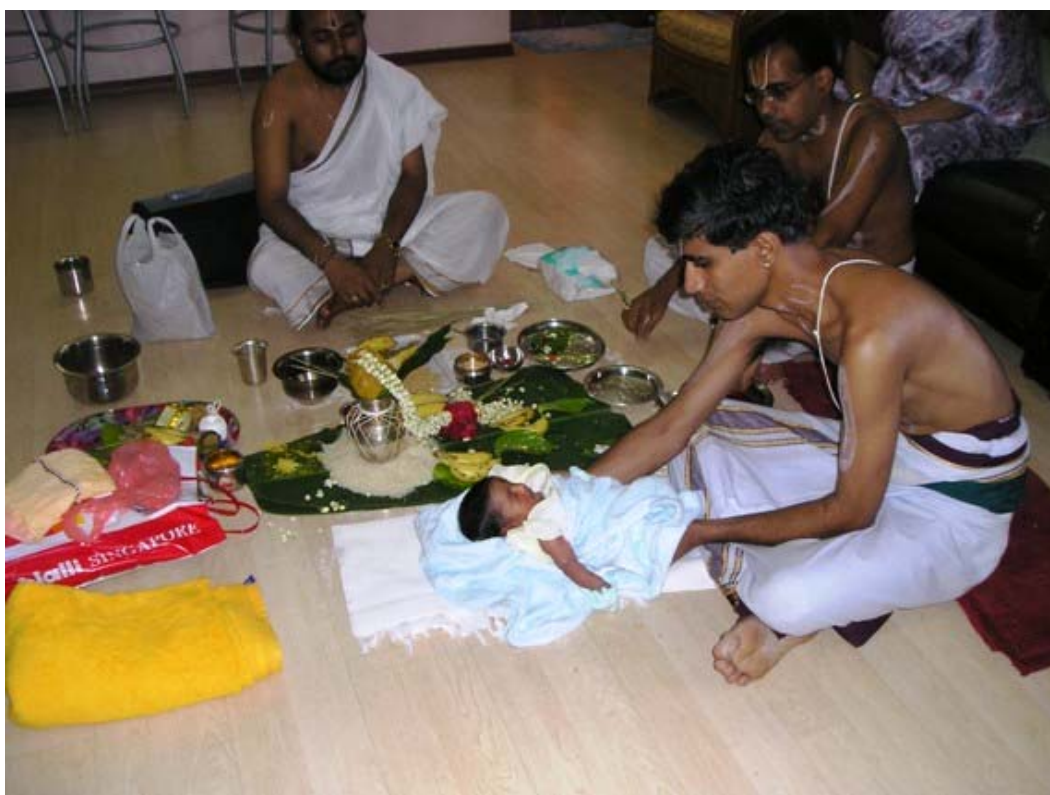
Over paddy grain bed

its eleventh day of its birth (vide: PeriyAzhwaAr's celebration of Sri KrishNA's NaamakaraNam in his Thirumozhi). There are strict rules in choosing the name for the newly born based on the constellation at the time of birth or the time of the day, when the child is born. As PeriyAzhwaAr has instructed us, auspicious names associated with Sriman NaarAyaNA and MahA Lakshmi or great AchAryAs should be chosen for the baby with the lessons learned from AjaamiLOpAkhyANam.