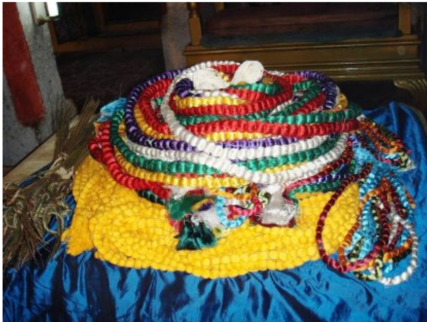
pavitram for pavitrotsavam

otherwise-- in the daily worship of the Lord.