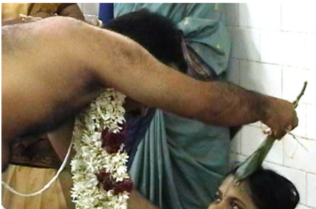
seemantham - parting of hair

Seemantham is to create a parting on the hair of the pregnant woman (Seemantham). That Parting is known as Vahidu amaitthal in Tamil. It is defined as "Yasmin KarmaNi garbhiNyA: seemantha unneeyathE" (that seemanthOnnayanam). It is done once and future pregnancies are taken care of this one time samskAram. Aapasthambhar's soothram is: "SeemanthOnnayanam praTamE garbhE chathurTE maasi"