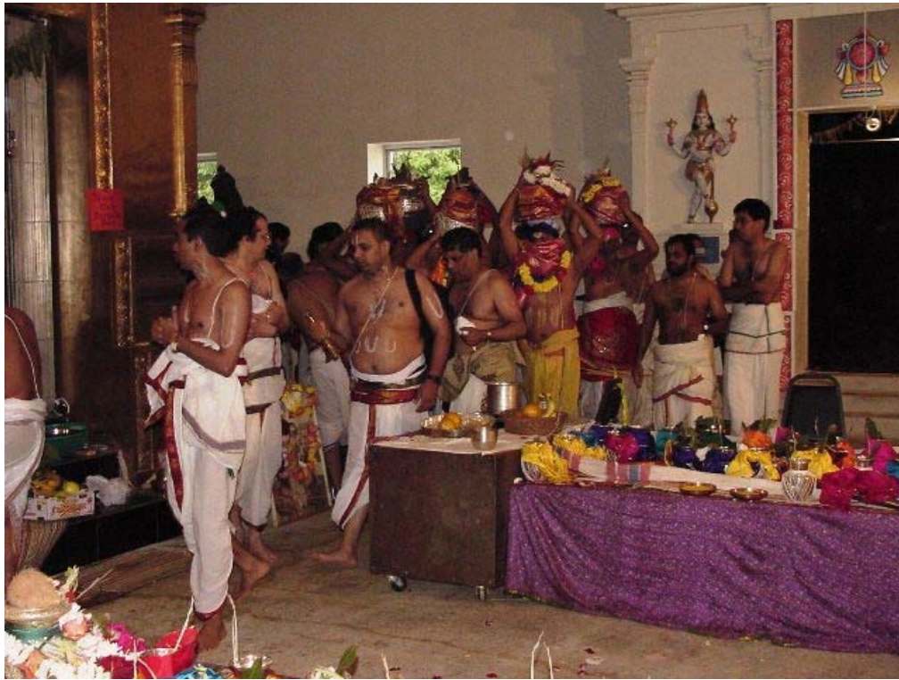
Kumbham procession during the 2001 samprokshana mahotsavam at Sri Ranganatha temple New York

though He has long been expecting them and enjoys them". Thus, He feels satisfied and also satisfies those who perform the Homams to please Him. This is understood by the wise and not by those, who have superficial knowledge about the injunctions, means and fruits of sacrifices. Hence, the name: "the secret of the Yaj~nam/Homam".