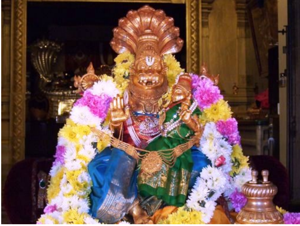
Bimbaaraadanam - Sri Lakshminarasimha PerumAL Sri Ranganatha Temple, New York